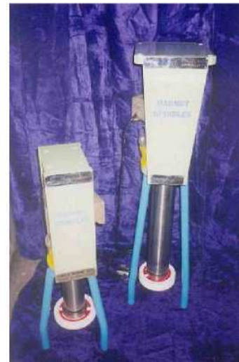
Vertical Grinding Head