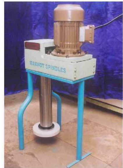
VERTICAL GRINDING HEAD ( BELT DRIVEN )

These Grinding Heads can transform many MACHINE to GRINDING MACHINE; and are of much use in Heavy duty Workshop and their maintenance departments.