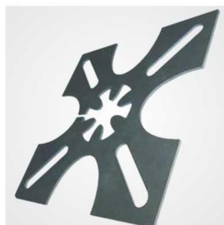
Machinery & Capital Goods