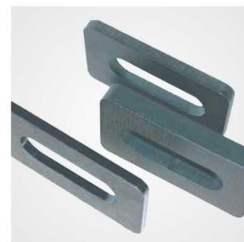
Electrical, Electronics & IT