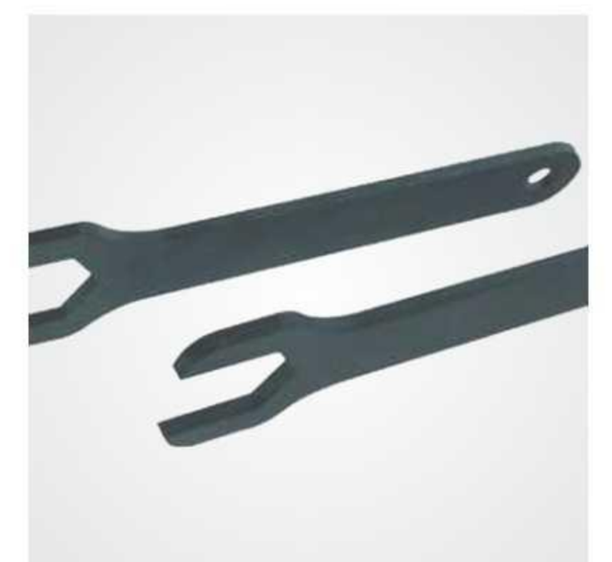
Defense & Aviation