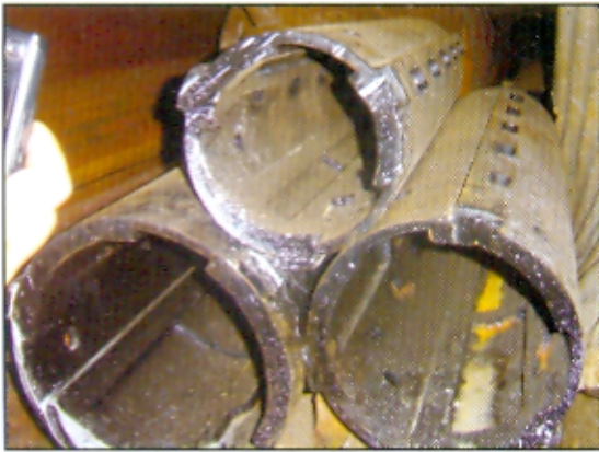
KELLY TERMINAL JOINT