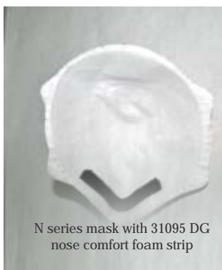
N series mask with 31095 DG nose comfort foam strip

Our latest offering to the industry is the NCFS (Nose Comfort Foam Strip) for various types of masks., including the vizor masks. These can be die cut to your special sizes and you may order in two colours i.e. light grey and dark grey. The foam strip elevates the comfort level of the user over a prolonged usage of the masks. Please do ask us for samples.