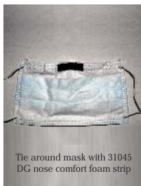
Tie around mask with 31045 DG nose comfort foam strip