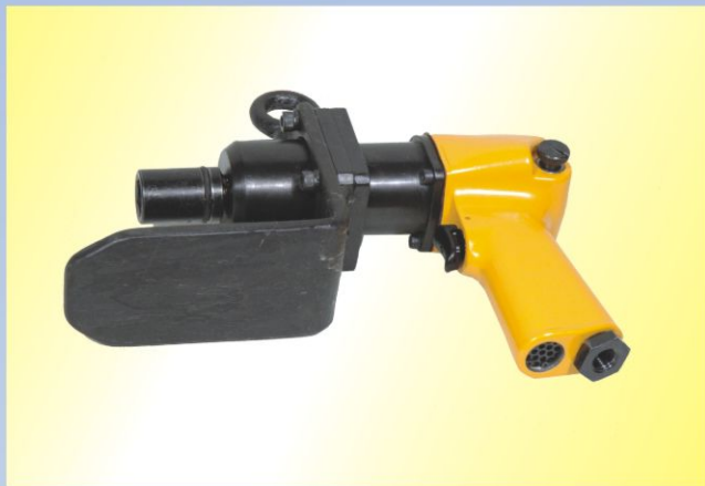
Special Custom built Tools