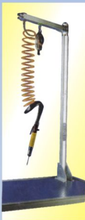
Swing Arm Stand